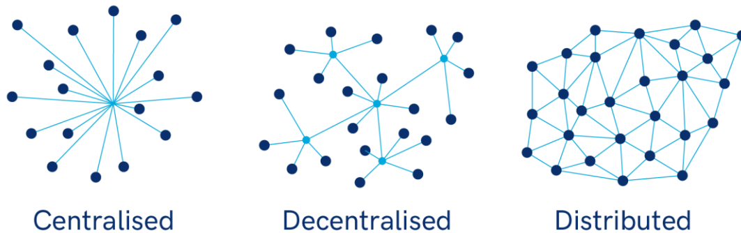
Figure 1: Centralised Databases vs Distributed Databases such as Blockchain